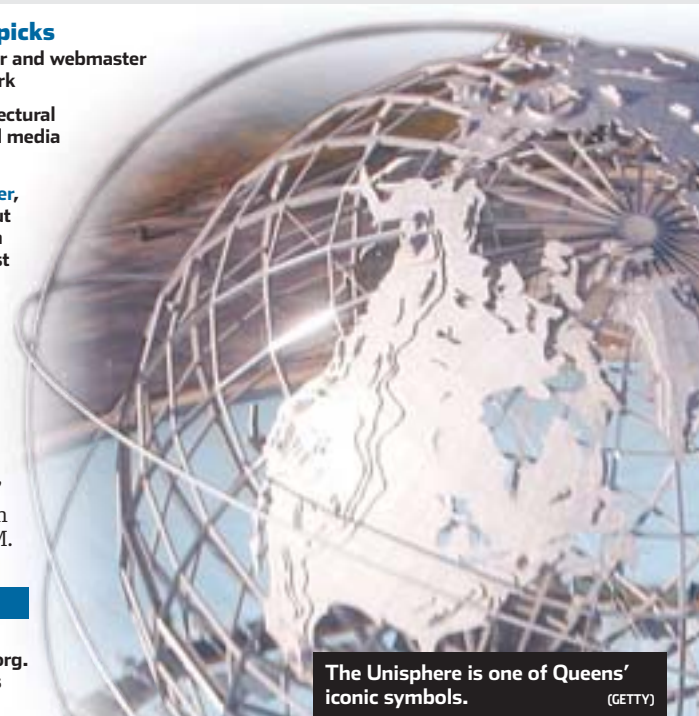
The Unisphere is one of Queens' iconic symbols.