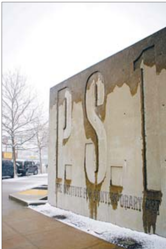
P.S. 1 is a MoMA outpost with a music series and outdoor party in the summer.

emerging, established and experimental art is one of the oldest such venues in the country. During the summertime, check out Warm Up, P.S. 1's critically acclaimed music series and outdoor party.