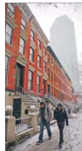
Brownstones grace 45th Avenue.