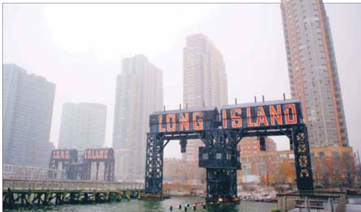
Gantry Plaza State Park preserves the gantries that have become a symbol of the reborn LIC.

And if people come here, they will find a surprising number of quality restaurants and businesses in the