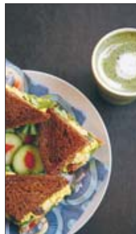
A curry sandwich and matcha latte from Communitea.

Named for a three-wheeled rickshaw, this Queens outpost of the now-closed Boerum Hill joint is a spacious and sleek spot to sample LIC's Thai and Asian fusion offerings. The pan-fried pork dumplings win raves.