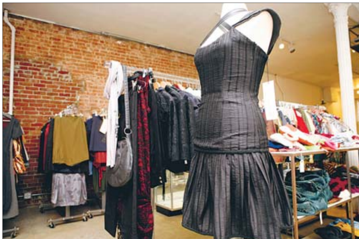
Shop for apparel by local designers and artists at Subdivision on Vernon Boulevard.