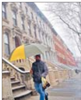
It may look like Brooklyn, but it's actually LIC.

LONG ISLAND CITY is bounded on the north and west by the East River; on the east by 31st Street, and New Calvary Cemetery; and on the south by Newtown Creek.