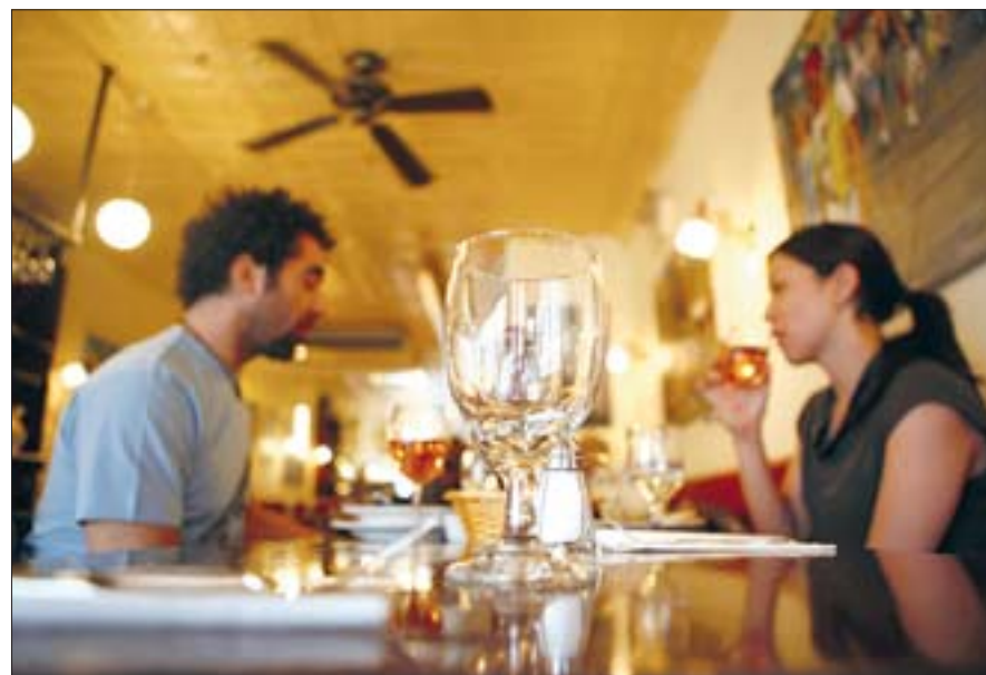
Enjoy classic French fare at easygoing bistro Tournesol.

Another ode to France, this corner bistro has all the faves — croque-monsieur, saucisson-beurre, escargot — as well as an impressive crepe menu.