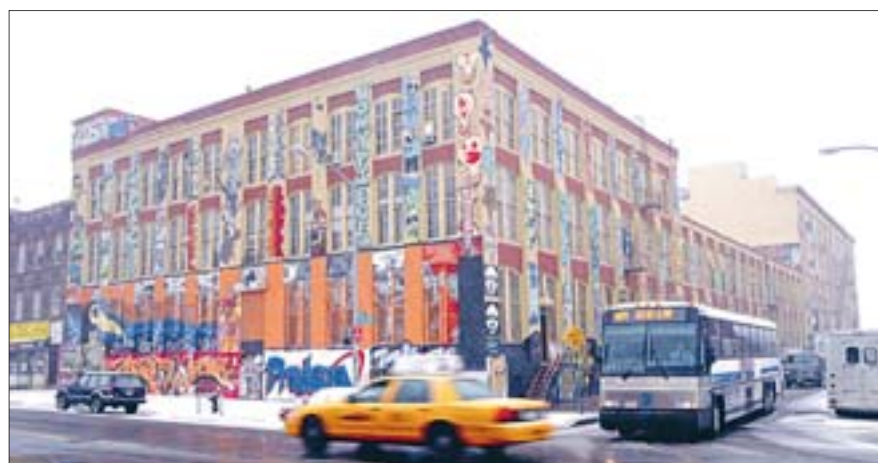
The 5 Pointz warehouse is world-renowned for its graffiti, contributed by many artists.

Three-bedroom, three-bath apartment in Arris Lofts. 1,850 square feet with 300-square-foot terrace. Manhattan views. 27-28 Thomson Ave.