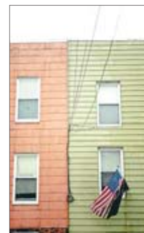
LIC's low-rise past can be seen on 50th Avenue.

Hunters Point area along Vernon Boulevard, and now, Jackson Avenue.